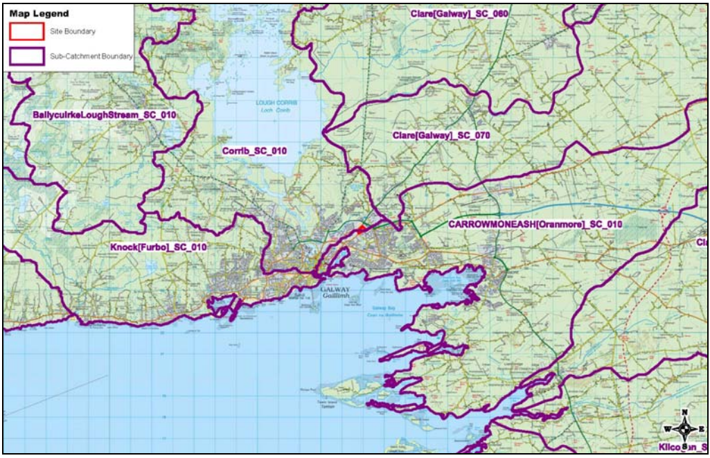
Figure 7.1 Regional Hydrology