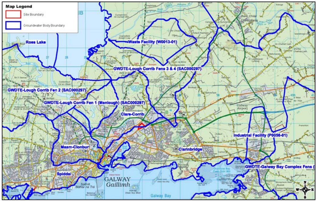
Figure 7.4 Local Groundwater Bodies