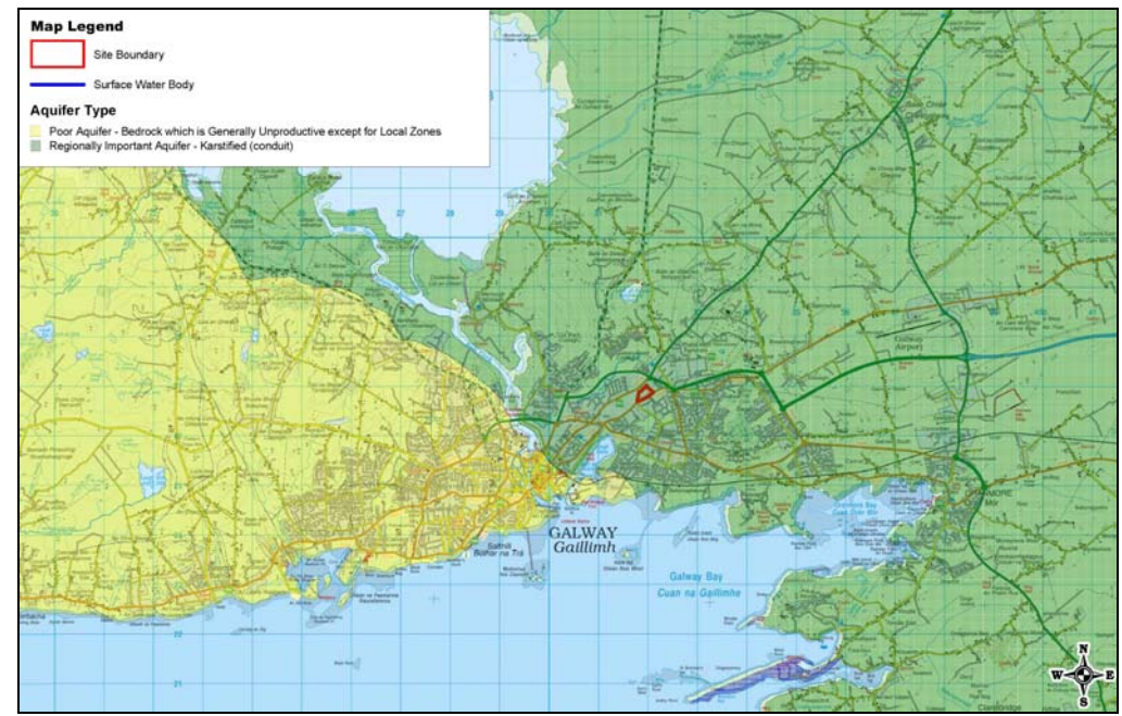
Figure 7.3 Bedrock Aquifer Map

The location of the existing sump at the eastern site boundary indicates that water naturally accumulates at this location. On a precautionary basis, it is understood that protective measures have been incorporated into the engineering design of the basement at this location to ensure its integrity and allow subsurface water to flow around the basement if required.