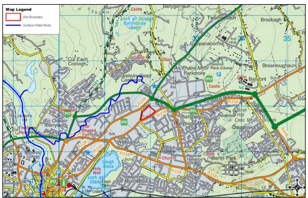
Figure 7.2 Local Hydrology